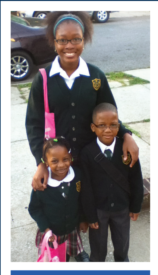
"My son was very happy on his first day of school and he was so proud to tell everyone that he got a scholarship."