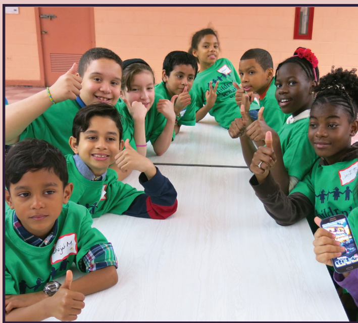
CSF Scholars ready to sample the healthy food they made.