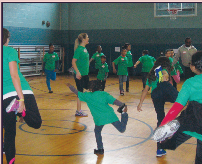
Before the cooking lesson, everyone warmed up with some exercise.