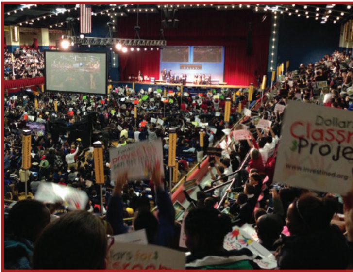
More than 5,000 people rallied for education tax credits in New York this November.