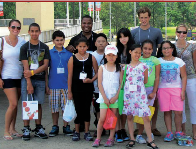
CSF's Young Leaders enjoyed a trip to the U.S. Open with CSF Scholars just before the beginning of the school year.