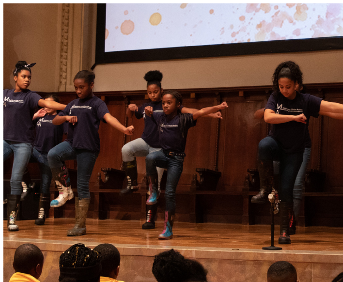
Kicking off the festivities, students from Manhattan Christian Academy performed a high-energy gumboot dance, which originated with gold miners in South Africa.

The grand finale came when students from eight schools – including Jewish, Islamic, Christian, Catholic, and Independent schools – performed an excerpt from Dr. Martin Luther King Jr.'s "I Have a Dream" speech. You can watch excerpts from the event at http://bit.ly/NYNCSW19 .