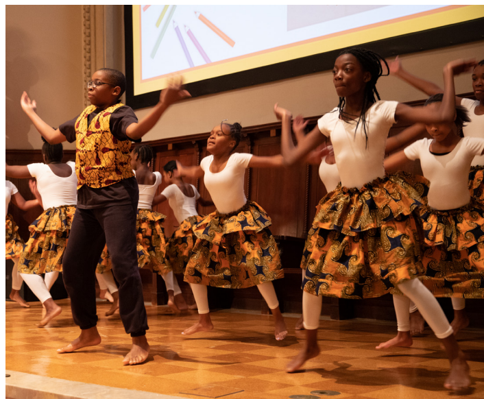
Students from The Learning Tree Cultural Preparatory School impressed the audience with their African dancing and drumming performance.